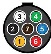
7 Pin Socket