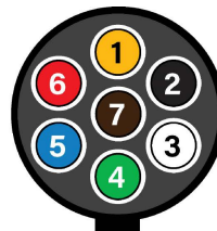
7 Pin Plug