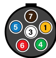
6 Pin Plug