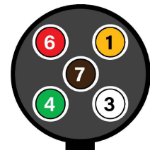
5 Pin Plug