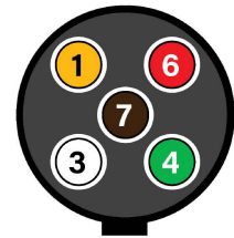
5 Pin Socket