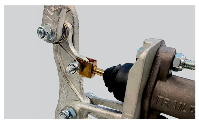
Check the bolt on the plunger rod is not overtightened, the connection should pivot freely.