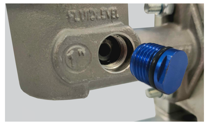
Check the two O-rings are in place behind the blue 'Autoback' bung and NOT damaged.